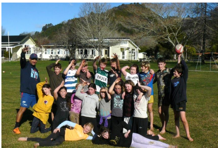
Yesterday we were privileged to have had a rugby training session with our senior students from Joe at Tasman Rugby. Excellent!