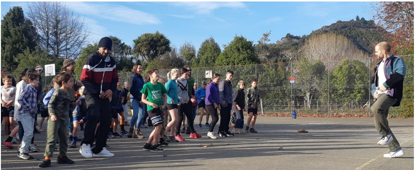
Above: more action from the 'dance court' on Friday!